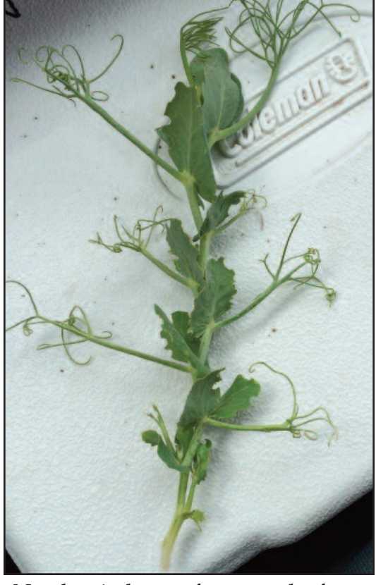
Notches in leaves from pea leaf weevil.