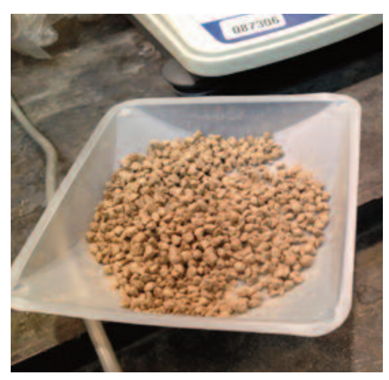
Figure 2. Granular struvite fertilizer manufactured from liquid pig manure

Recent innovations ... struvite, a "natural" granular fertilizer from urban wastewater or liquid manure - One of the strategies that could help us to restore P cycling between areas of crop production and crop consumption is the processing of manure and wastewater P into a more concentrated form that enables cost-effective long distance transport. Towards that end, engineers and