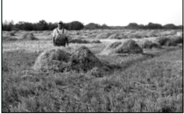
Piles of straw and chaff left in the field by the Whole Buncher.

According to a study conducted at the Western Beef Development Centre (WBDC) near Lanigan, land that had