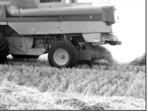
Whole Buncher in action.

cussed the Whole Buncher, sharing some of his observations and those of the cooperators. The Buncher can be mounted onto conventional or rotary combines but seems to work really well on the rotary. It's like a giant pitchfork on the back of the combine with spring steel fingers collecting about 150 lbs of straw and chaff together and then dumping the material into a pile. The piles are relatively small but are easy for the cows to get at. While the device looks easy to build and set, it isn't. The cooperators agreed that it takes about an entire day to mount the unit and get the proper setting. There were problems fitting the mounting brackets on the different makes & models of the combines. Adjustments often had to be made. Much of the problem stems from the fact