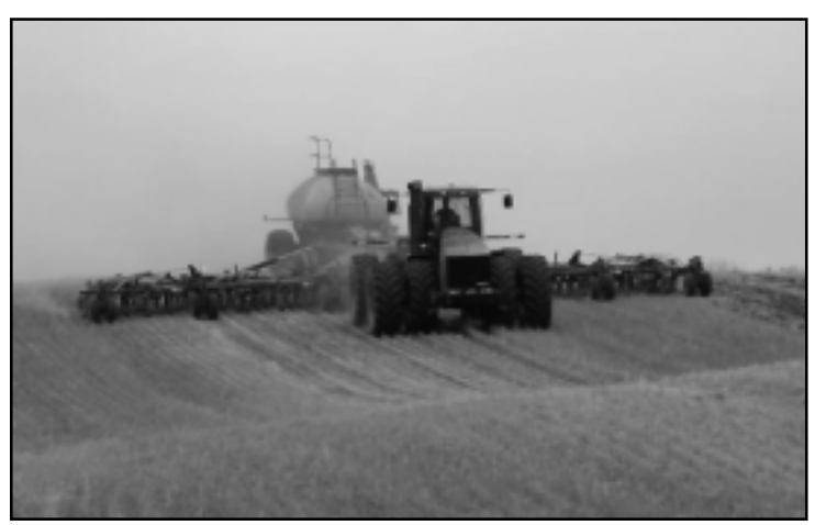
The Simpson's 57' Flexi-Coil 5000 air drill with the Flexi-Coil 50 series air cart. The air cart has three tanks and the variable rate option.

particular field, Vance claims that precision farming gave him an extra economic return of approximately $9 per acre compared to the constant check strip. Vance cautions this was an exceptional year for moisture, and that