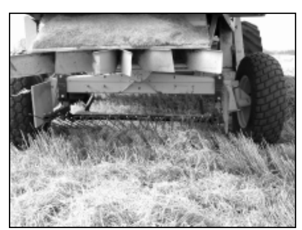
View of the Whole Buncher attached to the combine.

One of the first statements Lorne made in each of his presentations was that "winter grazing enables the cows to do the work". He went on to caution,