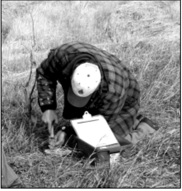
Eric Oliver using a syringe to extract greenhouse gases from the collection chamber.

agriculture lands. However, wetlands and riparian areas may also be problem areas with high release of nitrous oxide emissions when tilled or when the land around the riparian area is farmed or tilled.. For this reason, this study is looking at greenhouse gas emissions from these susceptible areas as compared to the adjacent cropland at different landscape positions (crest, mid-slope and foot slope). It should be noted that wetlands can be sloughs that may dry