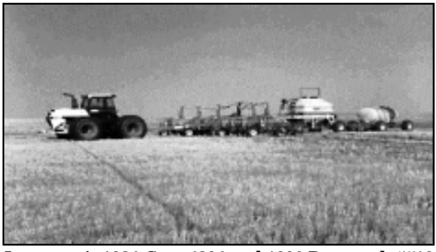
Lawrence's 1984 Case 4894 and 1996 Bourgault 5710 air drill.

stored soil moisture, residual soil nutrient status and expected rainfall. Since moisture and nutrient usage are directly related, we anticipate being able to determine an economical and environmentally sound nitrogen application program on the Lawrence farm at the end of this project. The results will be measured by the yield and protein data collected at the end of each year.