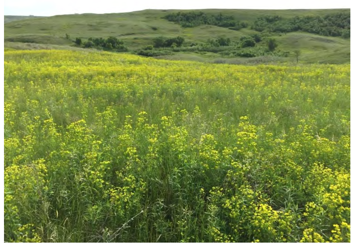
Leafy spurge infestation displacing native rangeland vegetation

Invasive plants are a threat to native and tame rangelands, to wildlife habitat and to recreational areas. They can spread agressively and have a negative economical, environmental and/or aesthetical effect. These plants are introduced from other countries or other environments. Without their natural predators, there is little to keep them from expanding in acreage. They take away valuable nutrients from existing vegetation and displace most vegetation in their path.