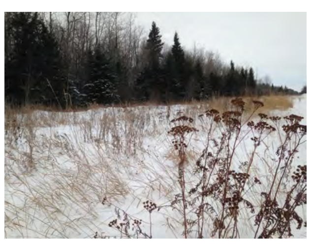
Common tansy seed spreading on top of the snow on a snowmobile trail

Brandon University conducted an economic impact assessment for leafy spurge in 2010. They estimated that the 1.2 million acres of leafy spurge in Manitoba cost 40 million dollars per year in both direct and indirect costs. The Canada Food Inspection Agency conducted a nationwide economic impact assessment in 2008 and estimated that invasive plants on all agricultural land (crop and pasture) in Canada cost approximately 2.2 billion dollars. These are only two examples of the significant price tags that can be associated as we strive to deal with invasive plants.