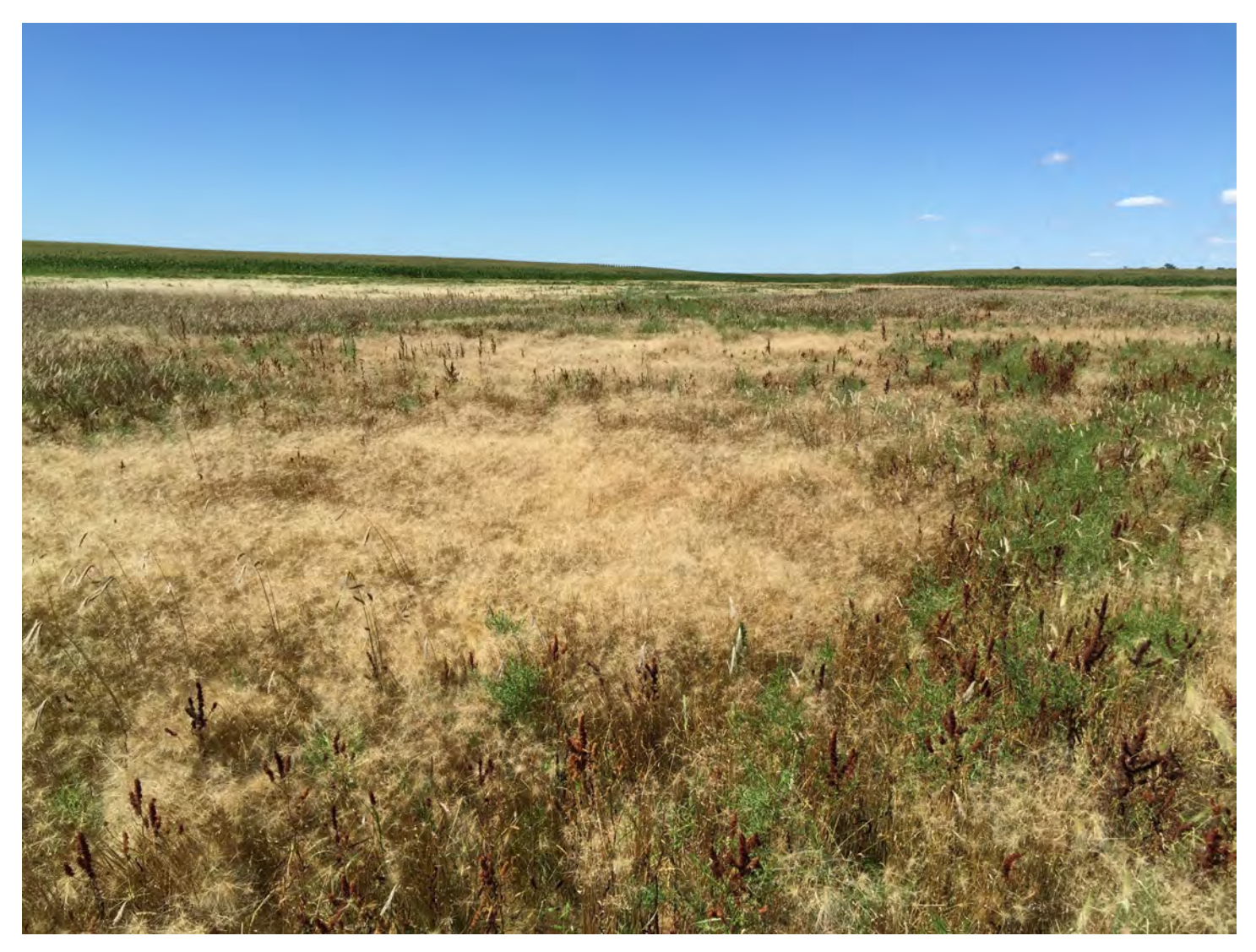
This seep area was once bare and now has some barley established along with weeds

A more practical approach that could be used in combination with the cover crops on the hilltop is to put a cover crop in the seep area. You won't get a good stand if the saline area is barren, but you may be able to work around the edges and keep those areas under control using cereal rye (fall seeded), followed by barley (spring seeded), followed by cereal rye (fall seeded). Once you can weave radish or dwarf essex rapeseed into the barley phase, do it. Both radish and dwarf essex will use a lot of water and help manage those areas. Be patient with these seep areas, they will take several years to get something growing. If you go from a bare area to having weeds that is a step in the right direction so don't get discouraged.