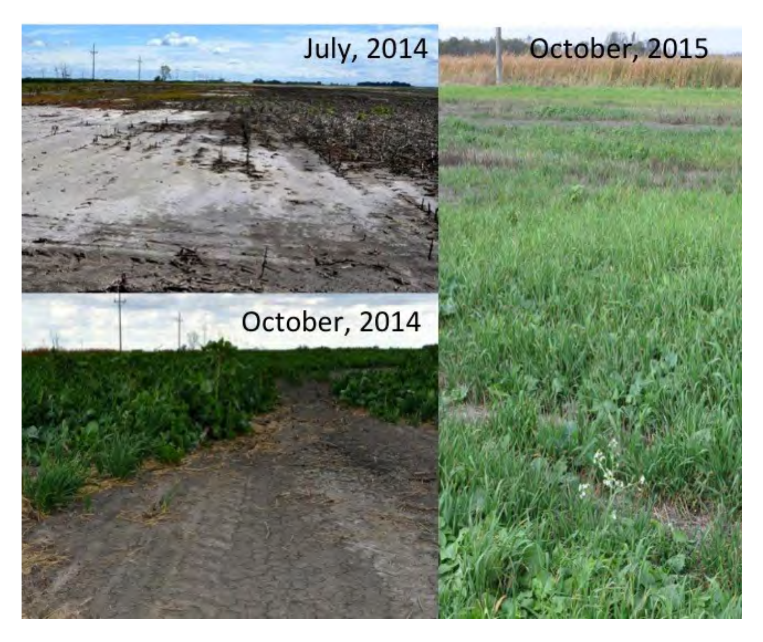
Improvements made to ditch effect salinity by using full season cover crops