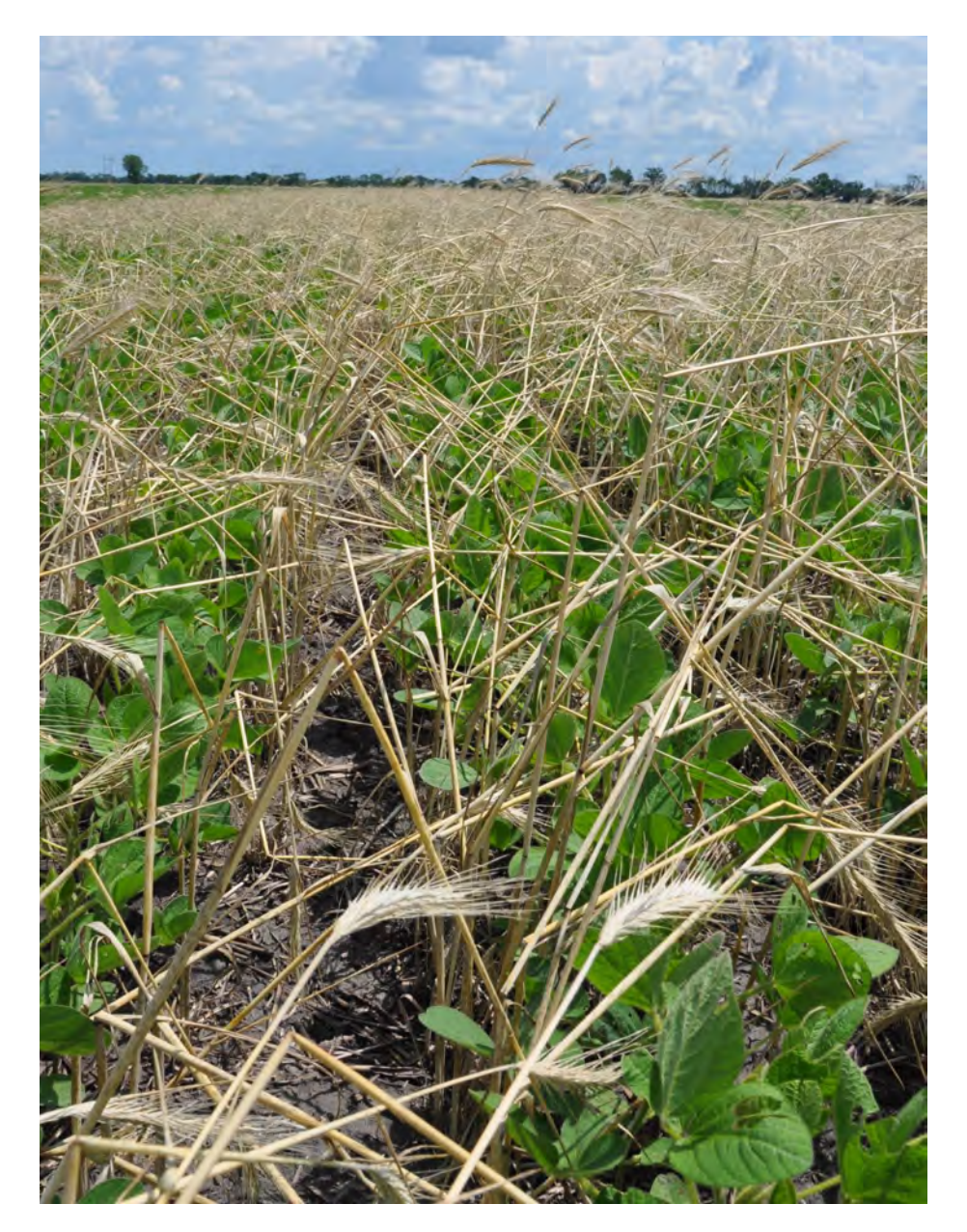
Soybean planted green into 40 lbs of cereal rye cover crop

Idea 2: If you feel your entire field could benefit and it fits with your rotation, seed cereal rye across the entire field in the fall, then plant green into that with a broadleaf crop. Farmers, Lee Trautman in Stutsman County and Tyler Speich in Sargent County are doing this with soybean and sunflower in North Dakota. Never do this before a wheat crop because you can't effectively control the volunteer rye in your wheat. Then plant your broadleaf crop directly into the cereal rye, but only where the cereal rye is "looking good". Spray out the cereal rye where you planted your crop and let the cereal rye continue to grow in the other areas. A poor cover crop is better than no cover crop. This will get a cover crop on your saline areas right off the bat and you won't have to go in later to seed those areas. It should help manage weeds as well through competition and the allelopathic effect of cereal rye (a chemical that leaks out of its roots).