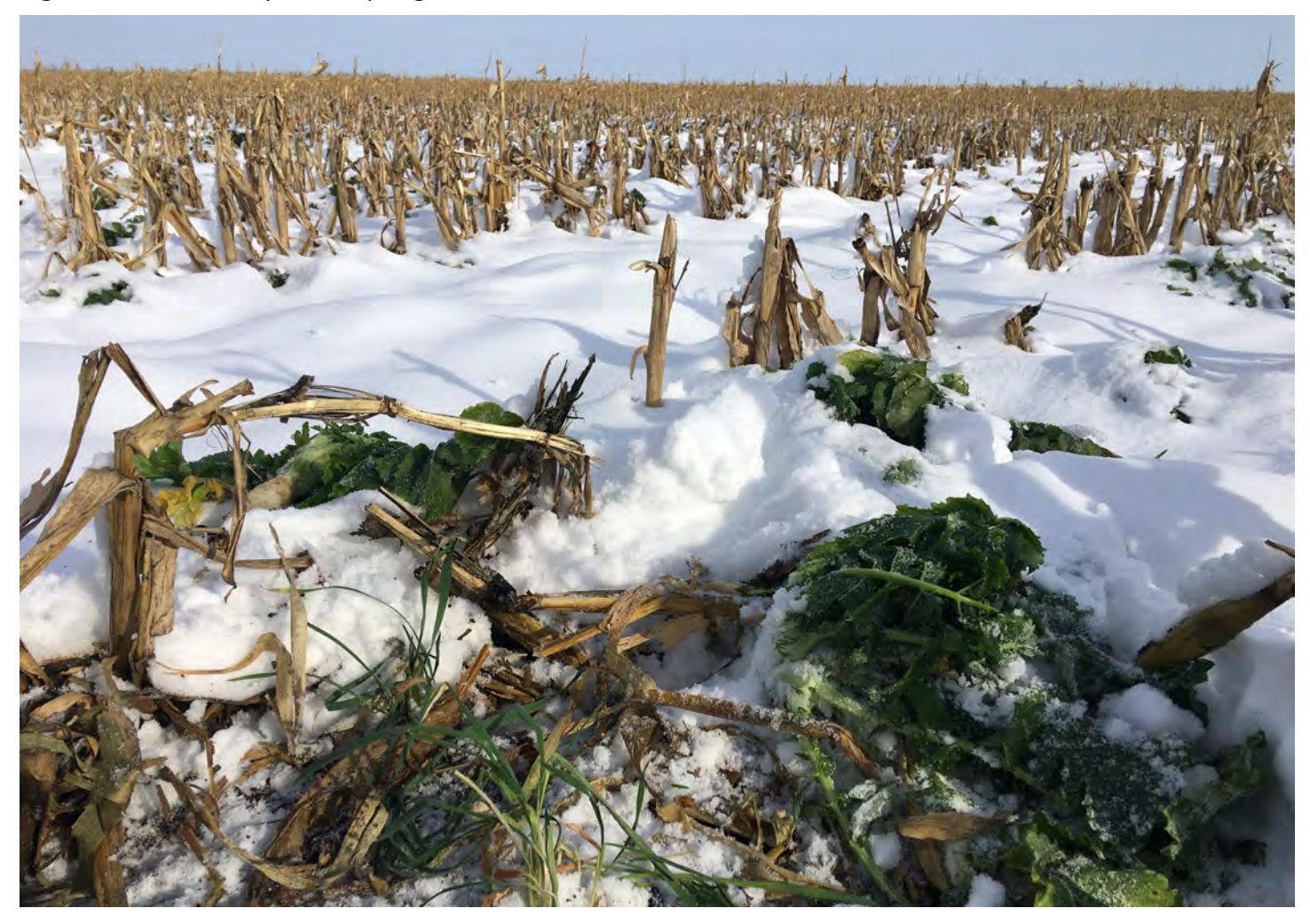
Managing salinity that results from a high water table by interseeding cereal rye into corn

Salinity issues as a result of a high water table are pretty common in the Red River Valley of North Dakota. We see a "wavy" response in the crop because this creates patches of salts across the field and varies based on micro-topography. In this situation, salts dissolved in the groundwater are moving up towards the surface through capillary action. Again, this is a process driven by evaporation, so anything that can reduce evaporation like reducing tillage and mulching along with high water usage by a cash crop followed by a cover crop is important. On these fields, we are also switching up our rotations to include more small grains, we are interseeding cash crops (in our case corn) with cereal rye and planting soybean directly into the living cereal rye. The goal is to use as much water as possible and have a cover crop overwinter to use moisture and manage salts immediately in the spring.